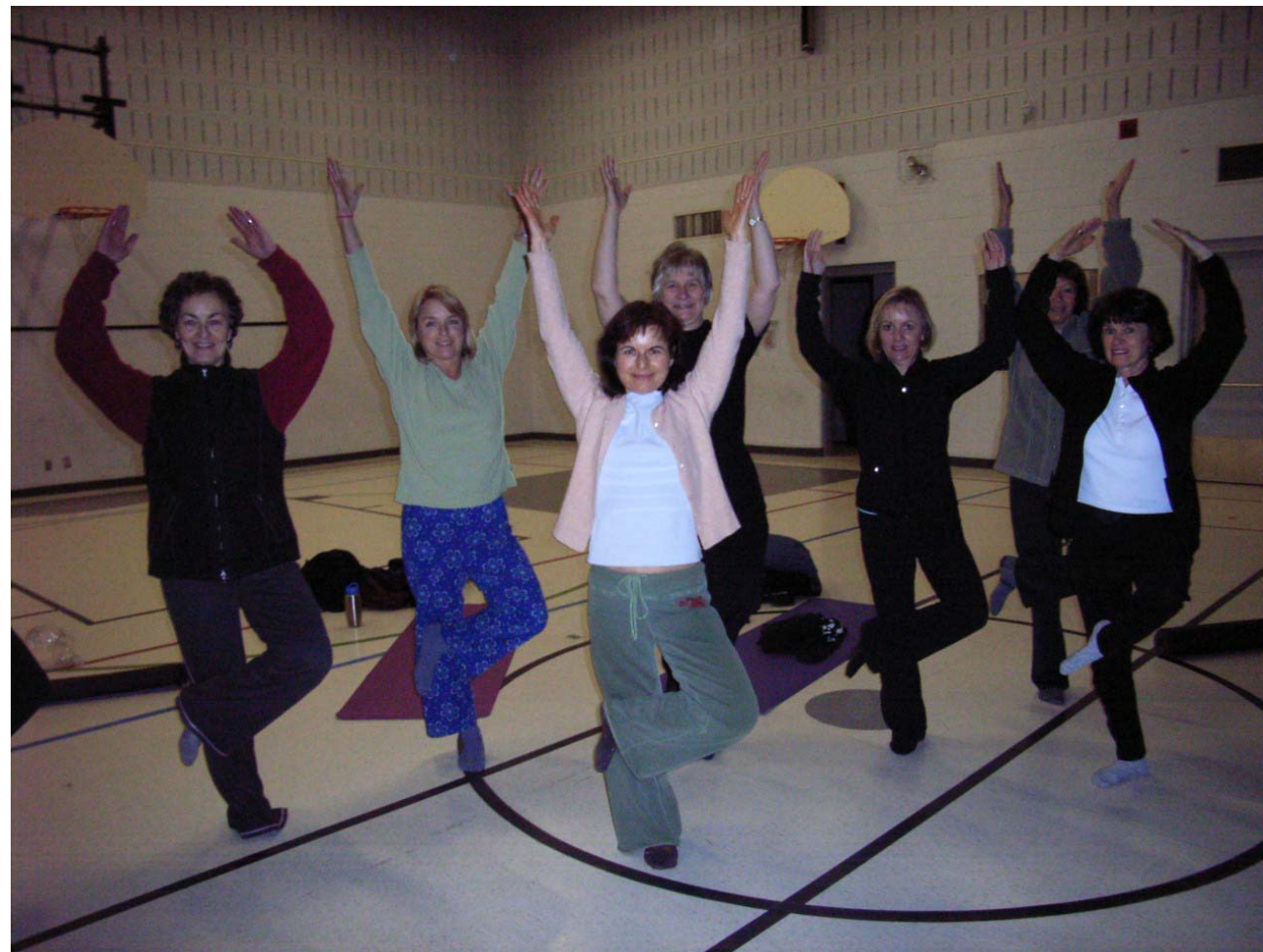
This picture is from a Yoga class on Monday evenings. These classes run in the St. Michael's School gym.